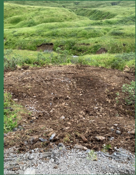
Photos 2 & 3. Qawalangin Tribe Debris Removal in Unalaska Valley, July 2020